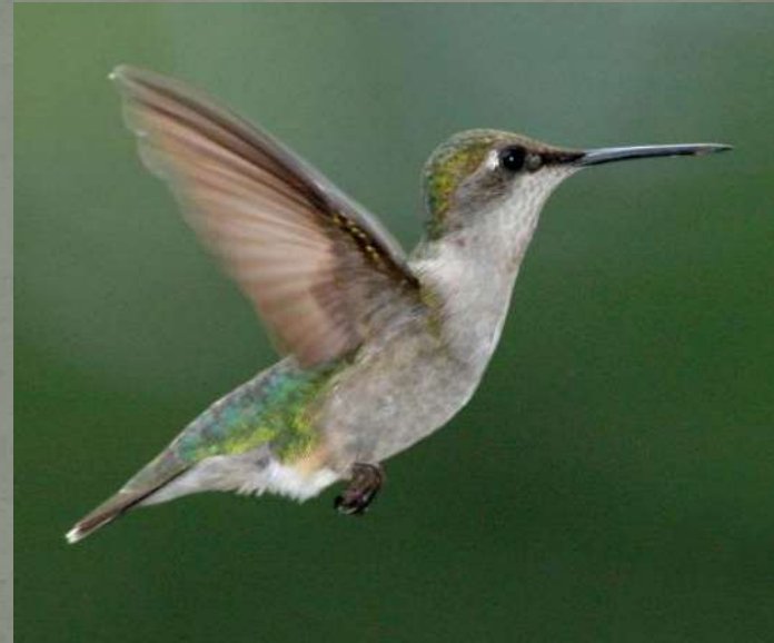
Female/ immature type – 3.75"