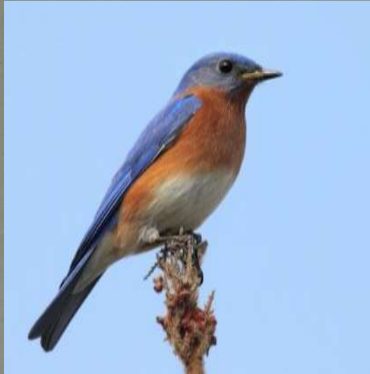
Adult male - 7"