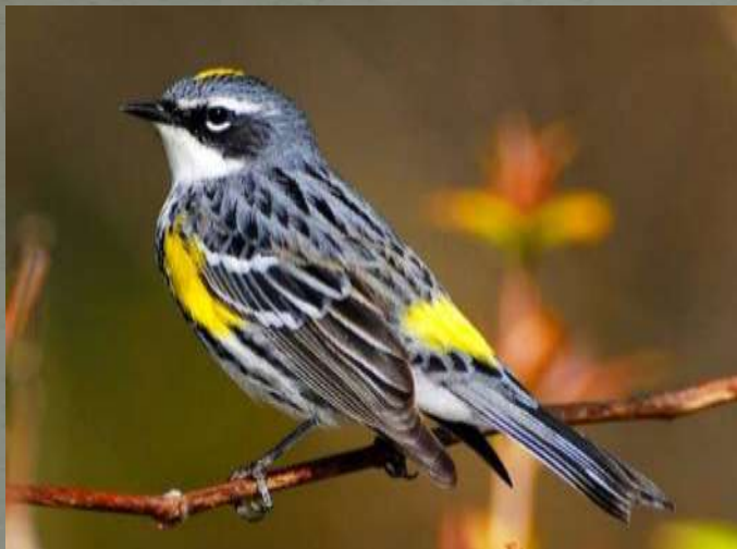
Adult male (Myrtle) – 5.5"