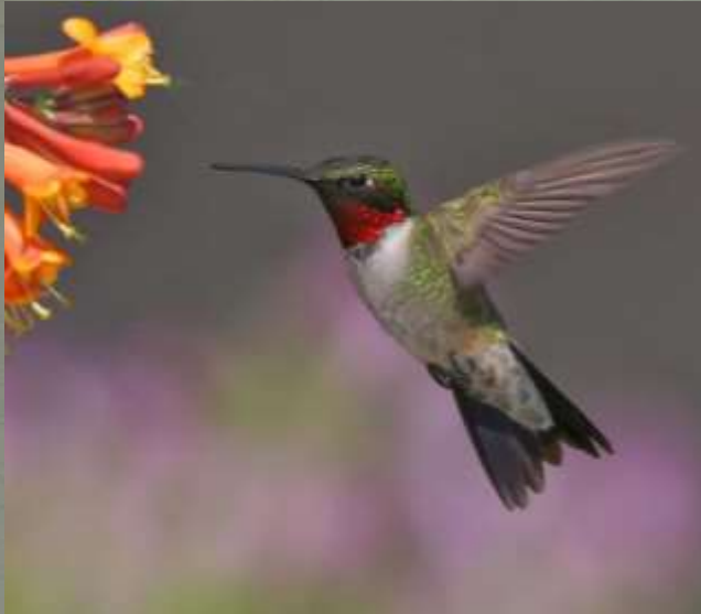
Adult male – 3.75"