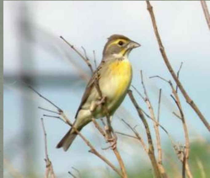
Female – 6.25"