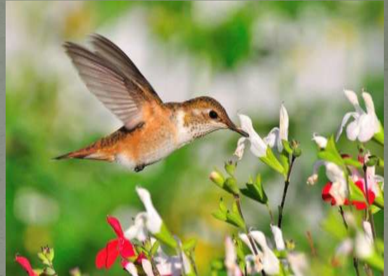
Adult female or immature – 3.75"