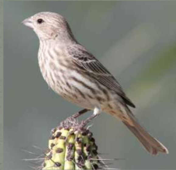
Adult female - 5.7"