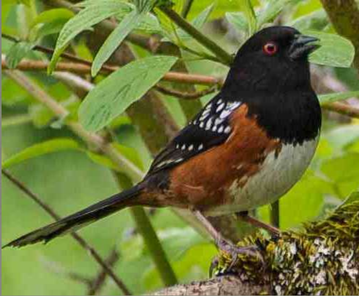
Adult male – 8.5"