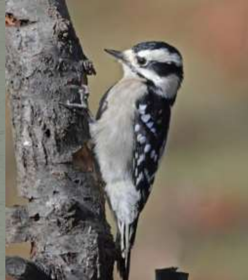
Adult female – 6.75"