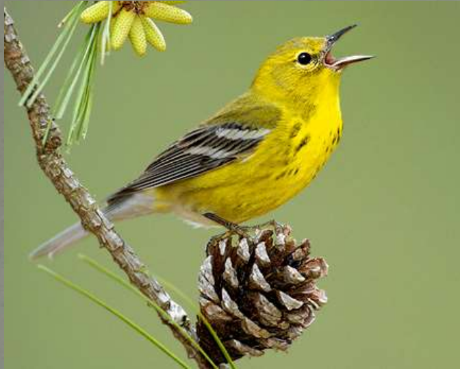
Male – 5.5"