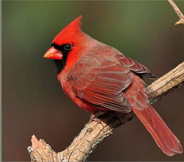
Adult male - 8.75"