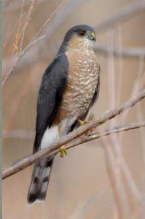
Sharp-shinned Hawk – 11"