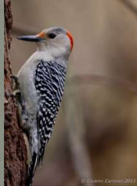
Adult female – 9.25"