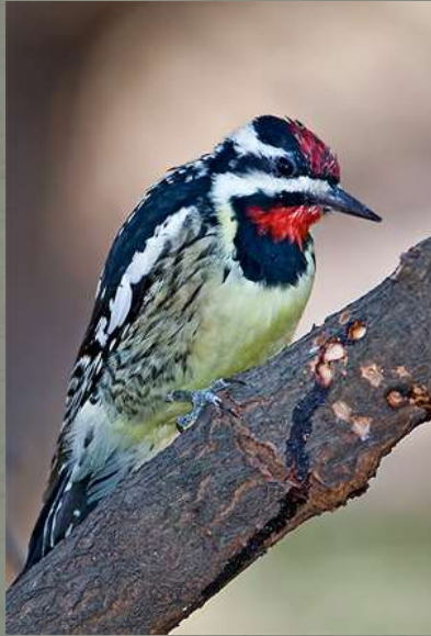
Adult male – 8.5"