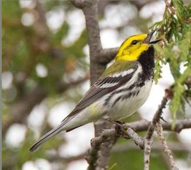
Male Breeding – 5"