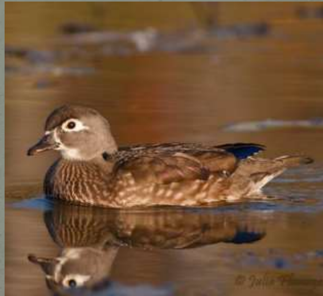
Female – 18.5"