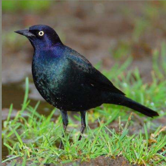
Adult male – 9"