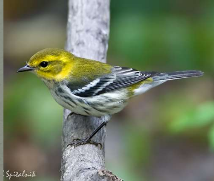
Female – 5"