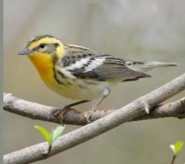
Female – 5"