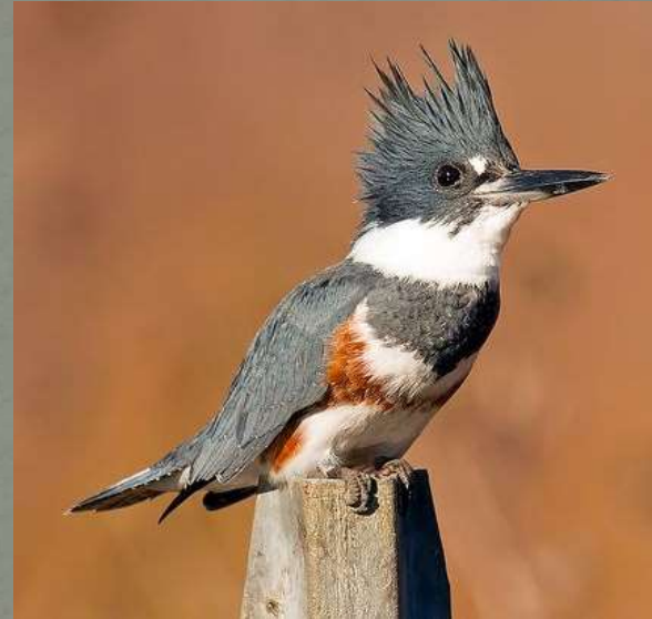
Female - 13"