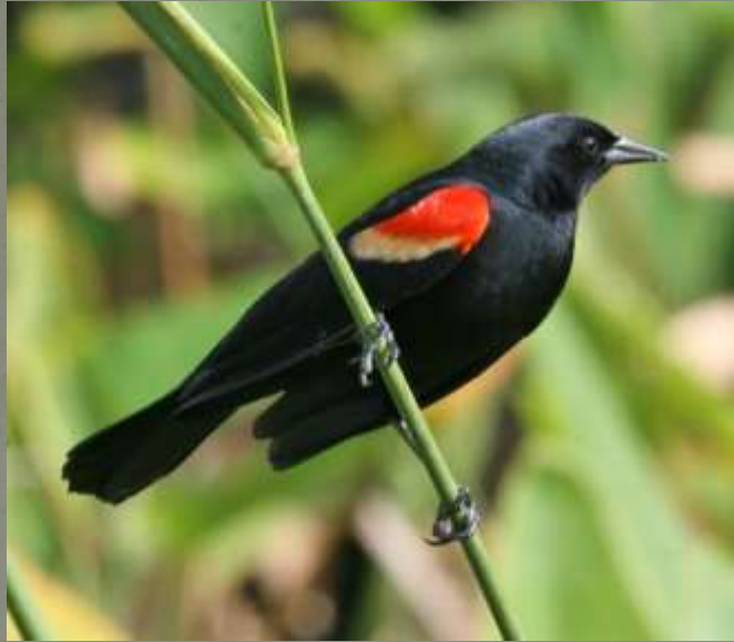
Adult male – 8.75"