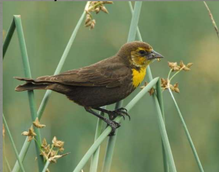
Adult female – 9.5"