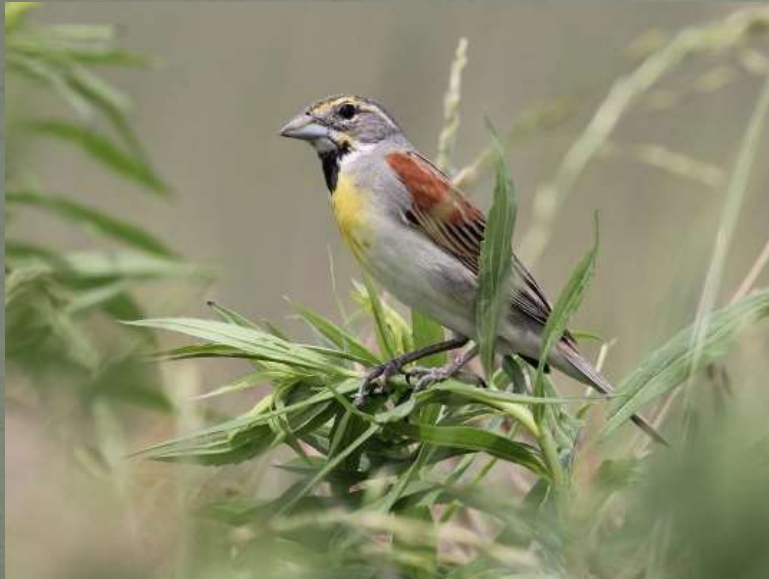
Breeding Male – 6.25"