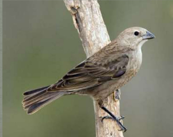
Adult female – 7.5"