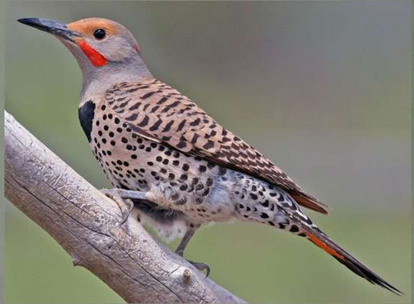
Red-shafted – 12”