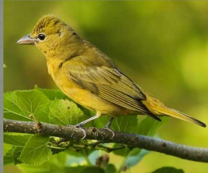
Adult female - 7.75"