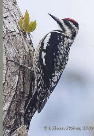
Adult female – 8.5"