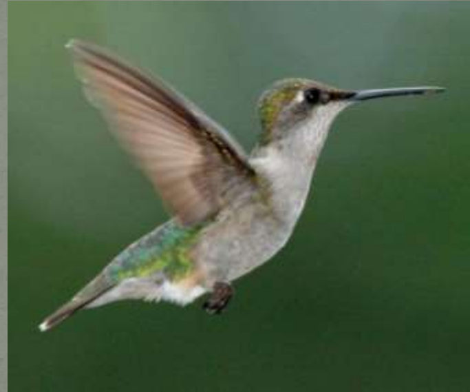
Female/ immature type – 3.75"