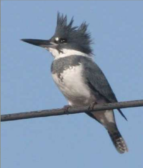
Male – 13"