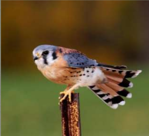
Adult male – 9"