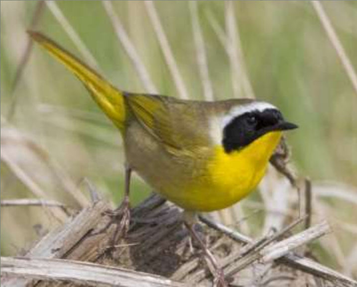
Adult male – 5"