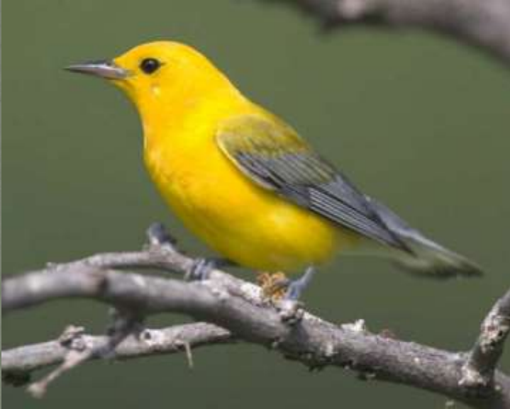
Adult male – 5.5"