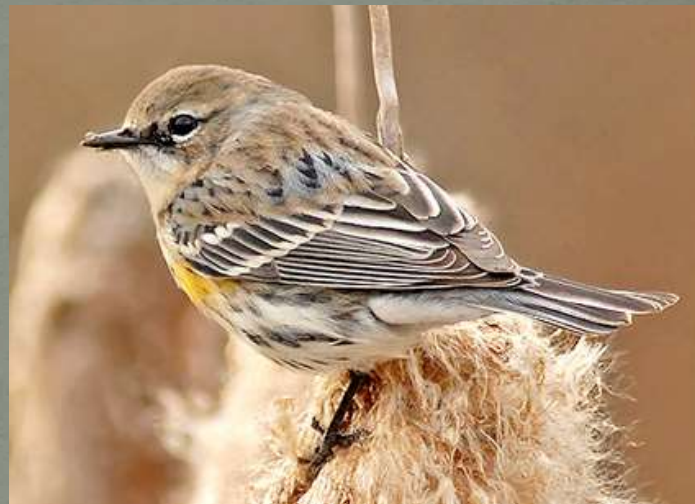
Adult female (Myrtle) – 5.5"