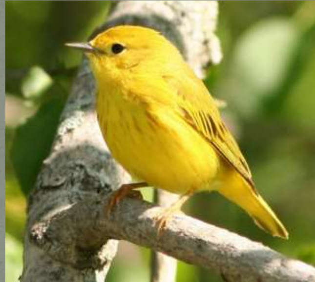
Adult female – 5"