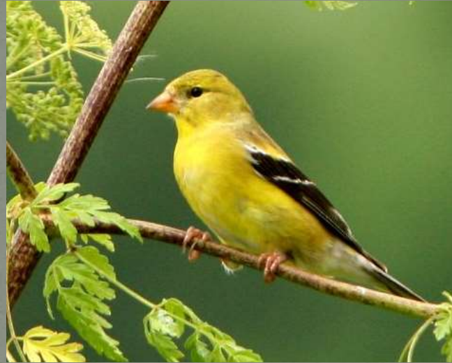
Adult female breeding - 5"