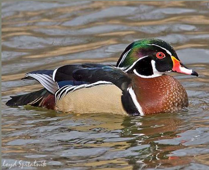
Breeding male – 18.5"