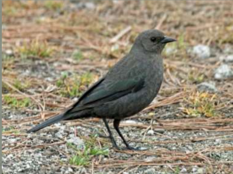
Adult female – 9"