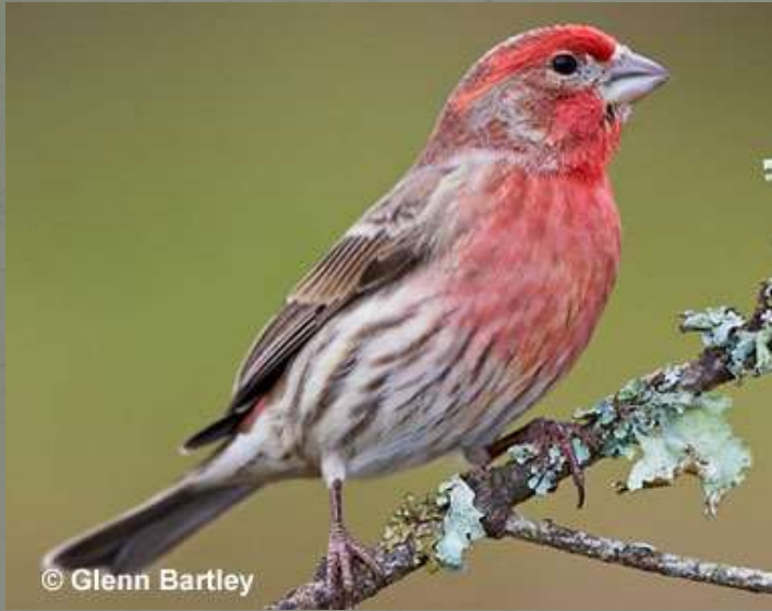
Adult male - 5.7"