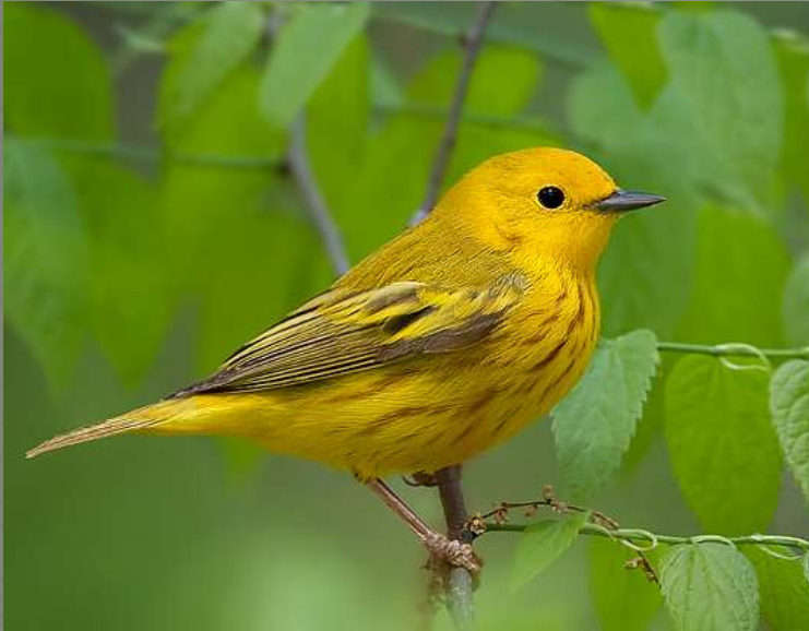
Adult male – 5"