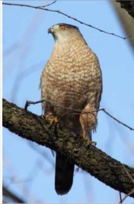
Cooper's Hawk – 16"