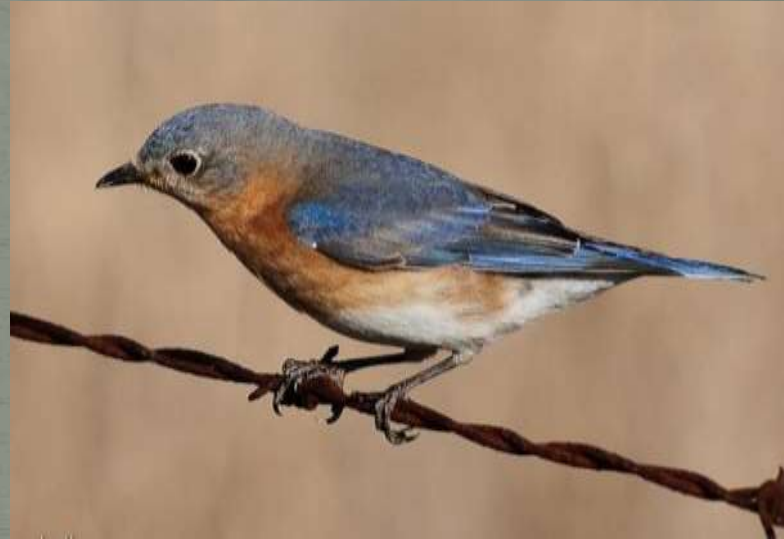
Adult female - 7"