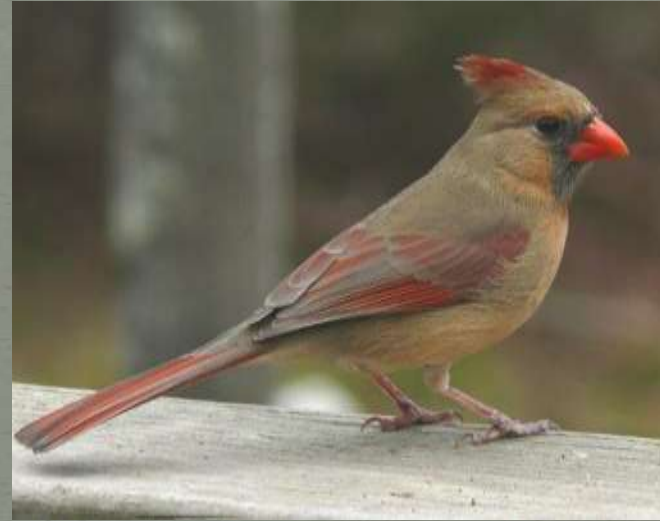
Adult female - 8.75"