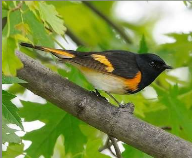
Adult Male Breeding – 5.25"