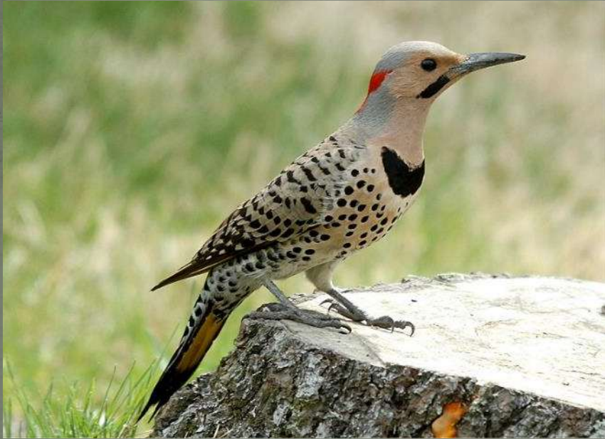
Yellow –shafted- 12”