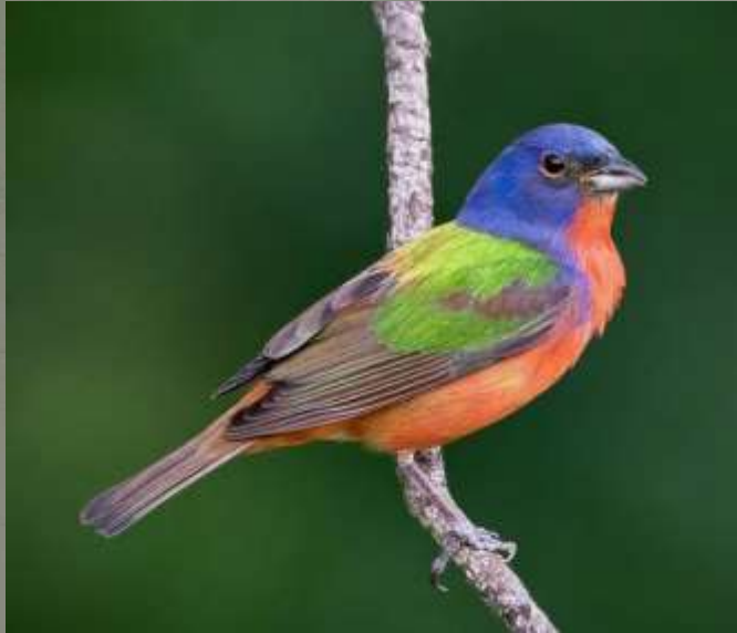
Male - 5.5"