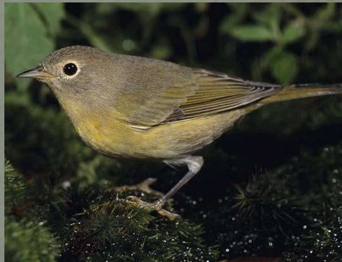
Adult Female – 4.75"