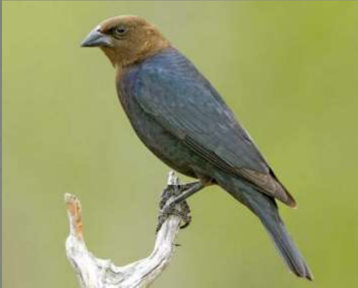
Adult male – 7.5"