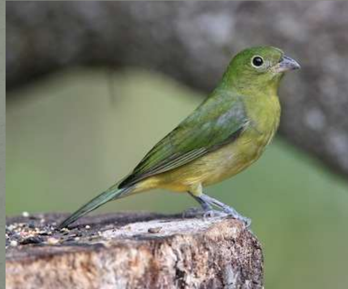
Adult female - 5.5"