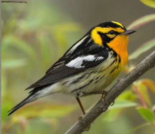
Breeding male – 5"