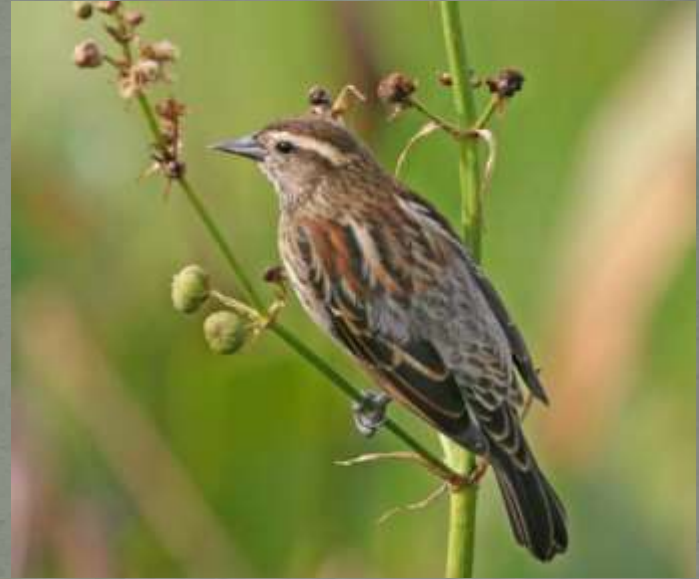
Adult female – 8.75"