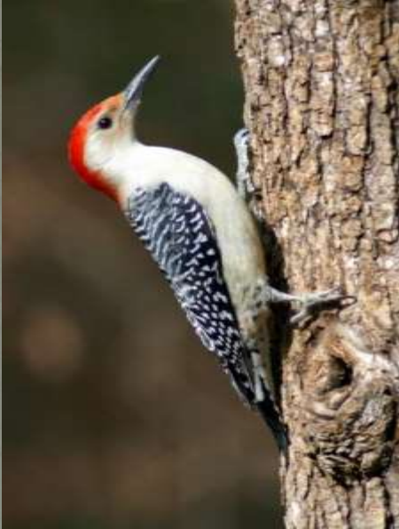
Adult male – 9.25"