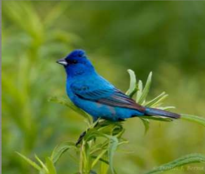
Breeding male - 5.5"