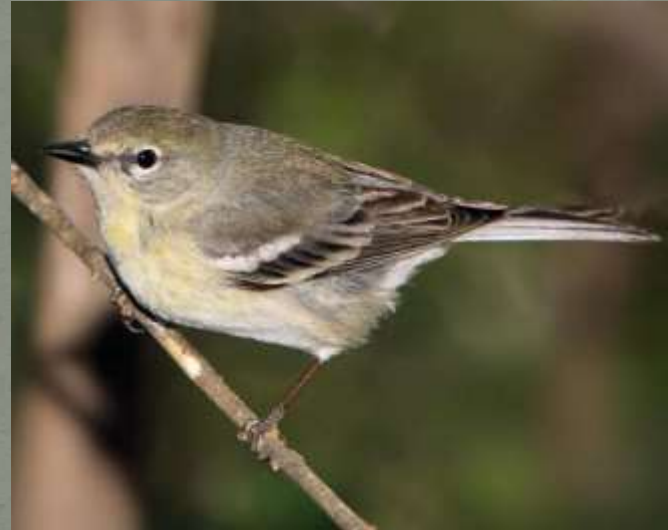
Female/juvenile – 5.5"