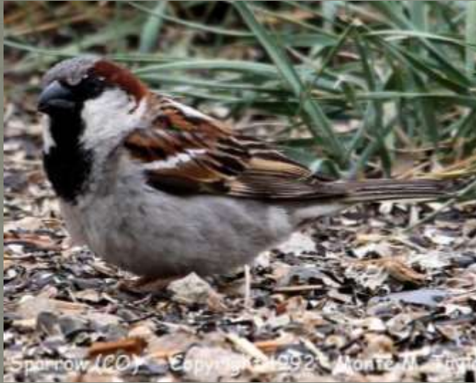
Adult male breeding – 6.25"