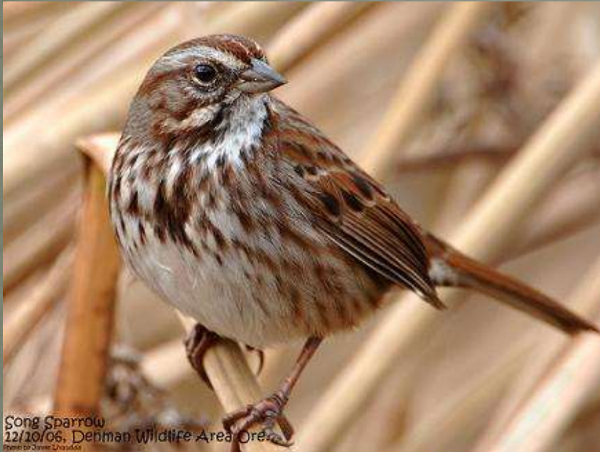
Song Sparrow 12/10/06, Denman Wildlife Area, Ore.