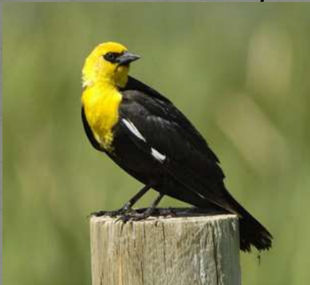
Adult male – 9.5"