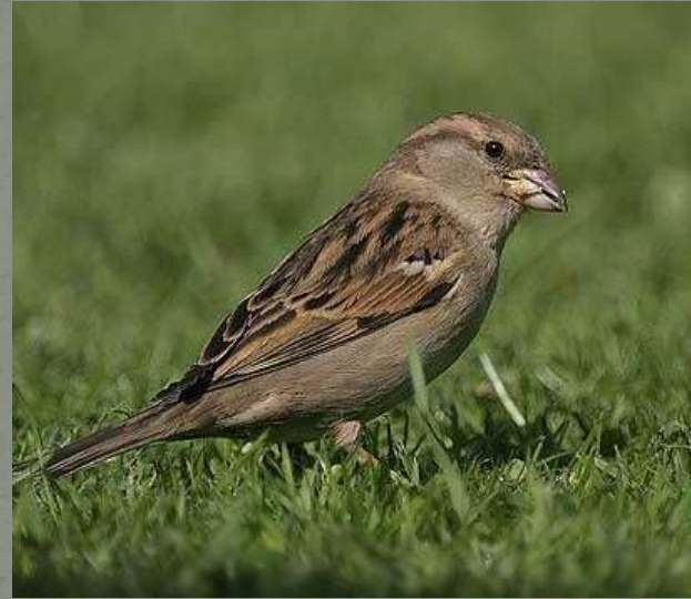
Adult female – 6.25"