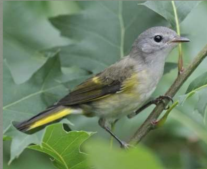
Adult Female -5.25"