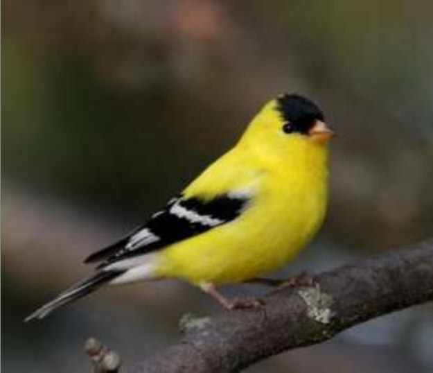
Adult male breeding - 5"