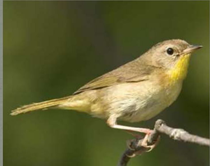
Adult female – 5"