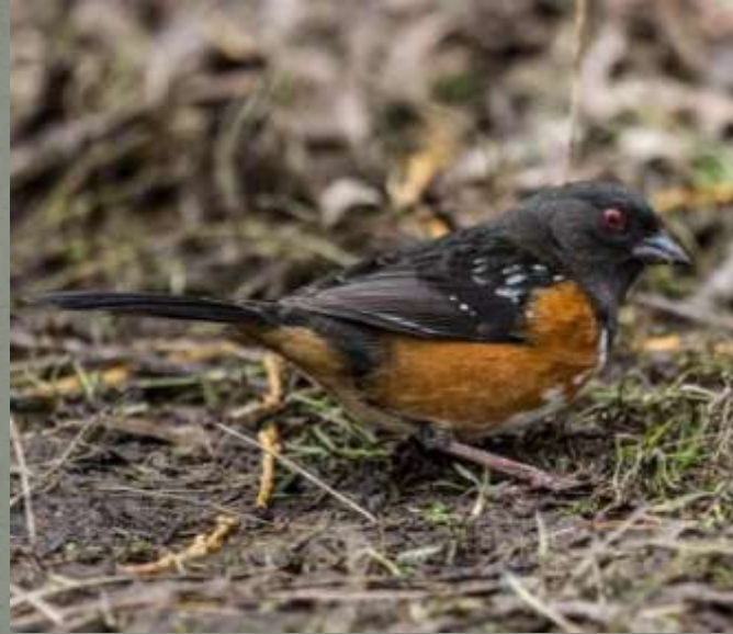
Adult female – 8.5"