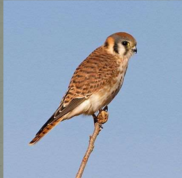
Adult female – 9"