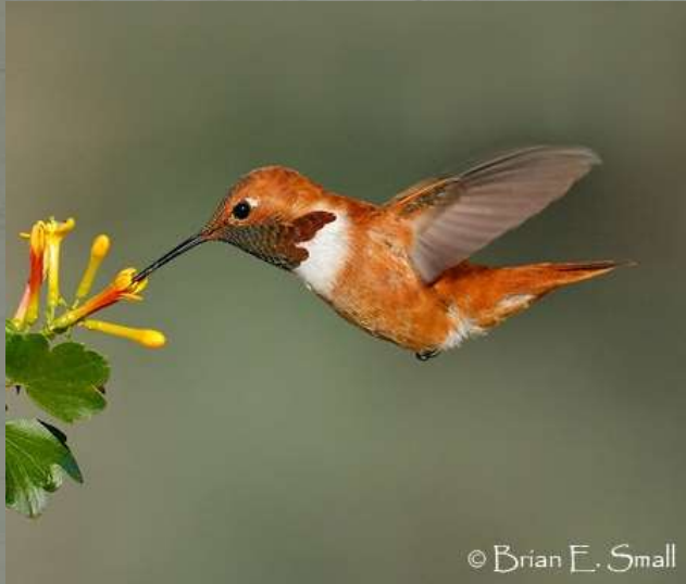
Adult male - 3.75"