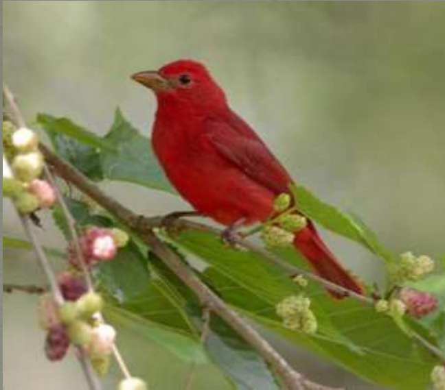
Adult male - 7.75"