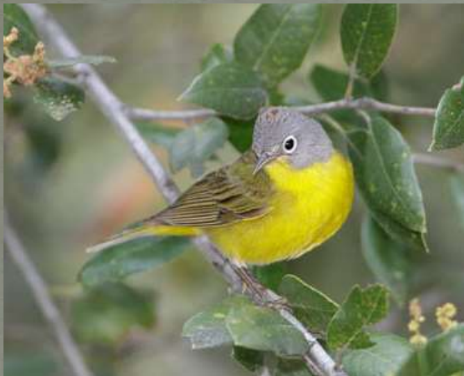
Adult Male – 4.75"