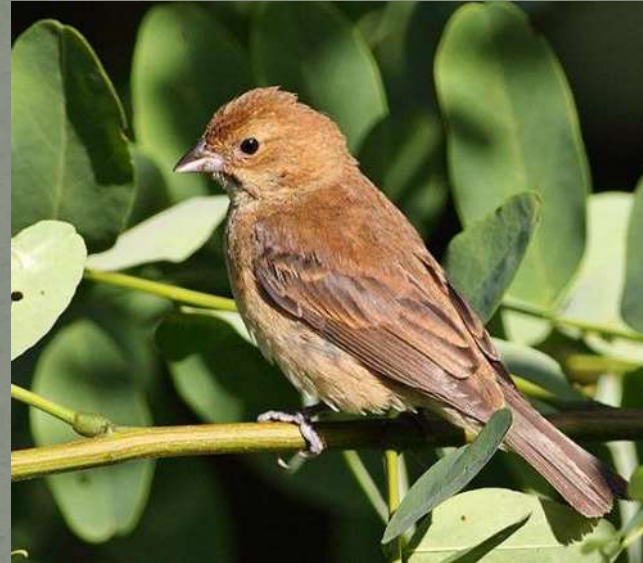
Female - 5.5"