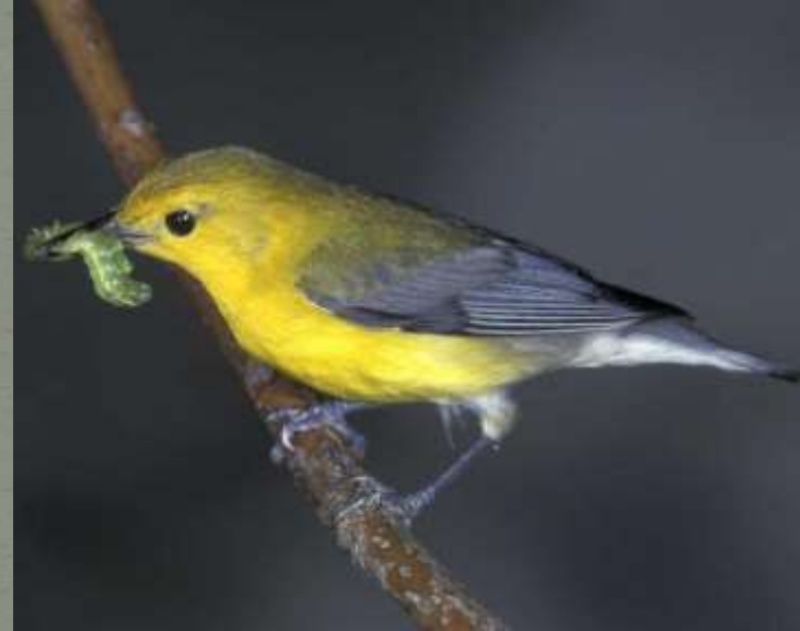
Adult female – 5.5"