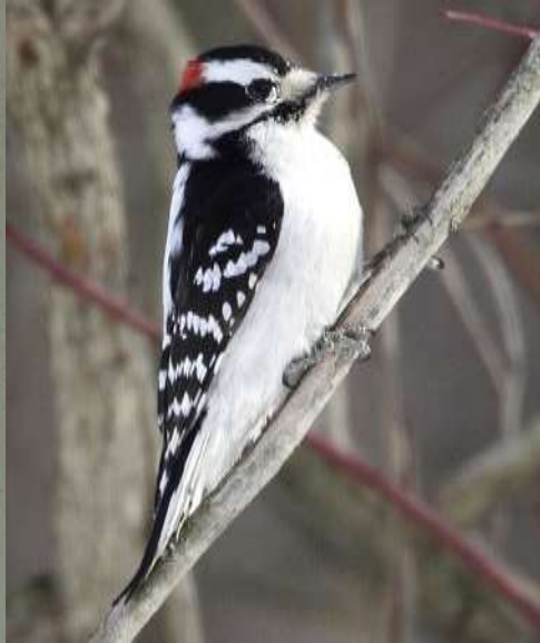
Adult male – 6.75"